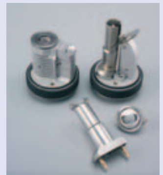
Quick and easy to change adapters and noses

Available in multiple languages with capability of adding more on request.